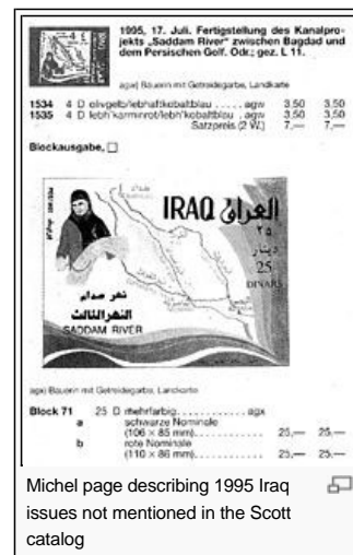
Michel page describing 1995 Iraq issues not mentioned in the Scott catalog